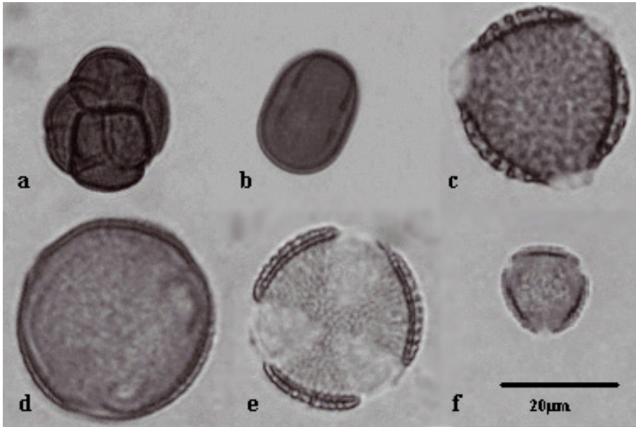
Figure 1. Main pollen taxa found in pollen loads and bee rectum: (a) Erica manipuiliflora , (b) Polygonum aviculare , (c) Ligustrum japonicum , (d) Parthenocissus inserta , (e) Sisymbrium irio , (f) Olea europea . All the plates are in the same scale.